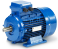
Hoyer industrial motors