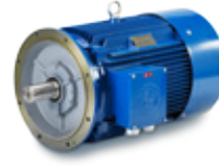
Hoyer marine motors