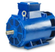
Hoyer drip-proof motors