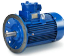
Hoyer EX motors