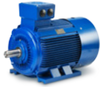
Hoyer ATEX zone 22 motors